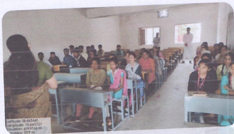
Student attending the Program: